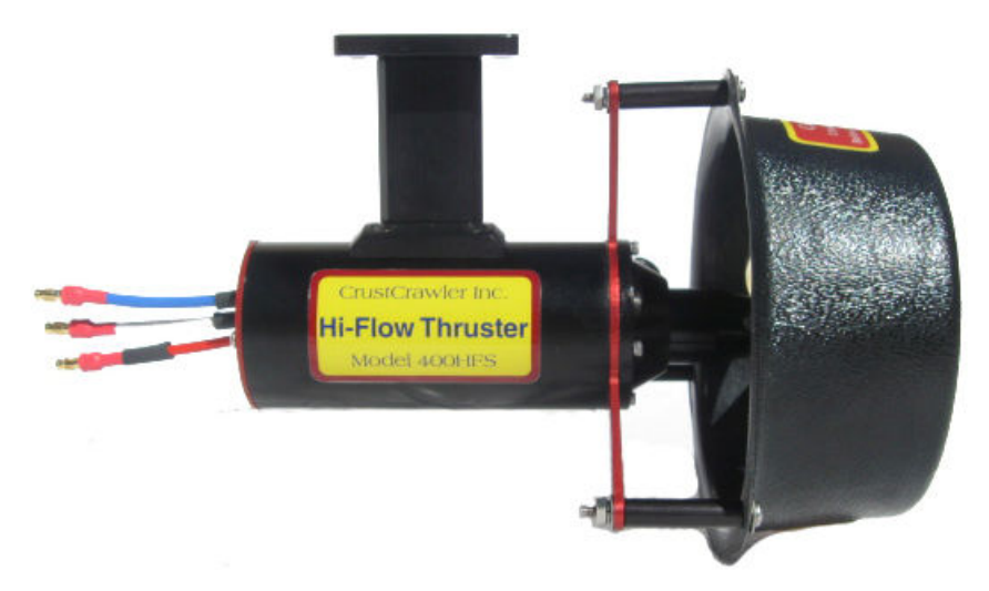
Figure 1 - 400HFS Thruster with Mounting Bracket